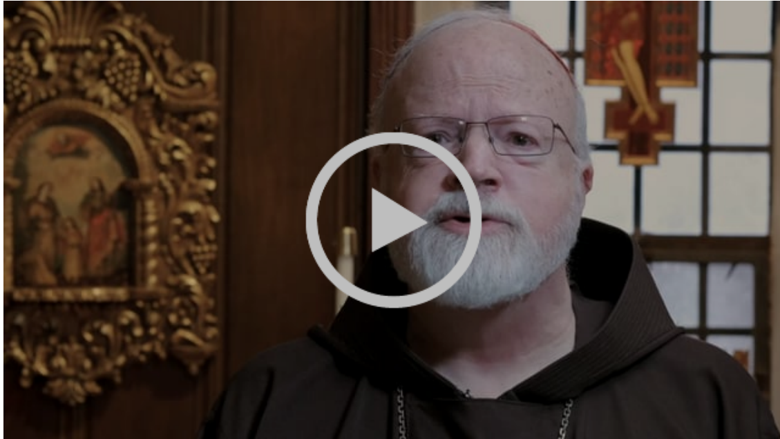
Cardinal Sean's Message to the Archdiocese